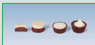
Double-Layer Power One-Shot