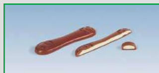
Long One-Shot filled bars