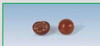
One-Shot with ingredients