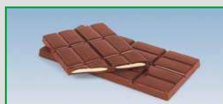
Long One-Shot tablets