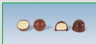
Standard One-Shot pralines, truffle balls, eggs, liqueur pralines